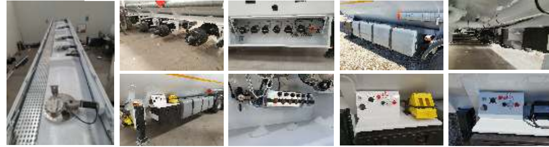
54000 LT FUEL TANK